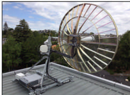
VEGA antenna layout